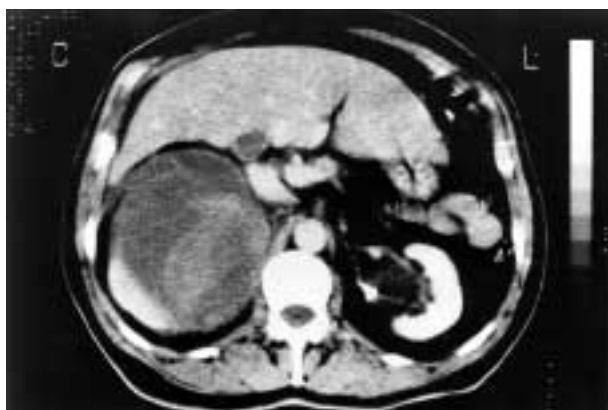
Fig. 1: Tomographic studies revealed a non contrast-enhancing formation destroying the upper pole of the right kidney.