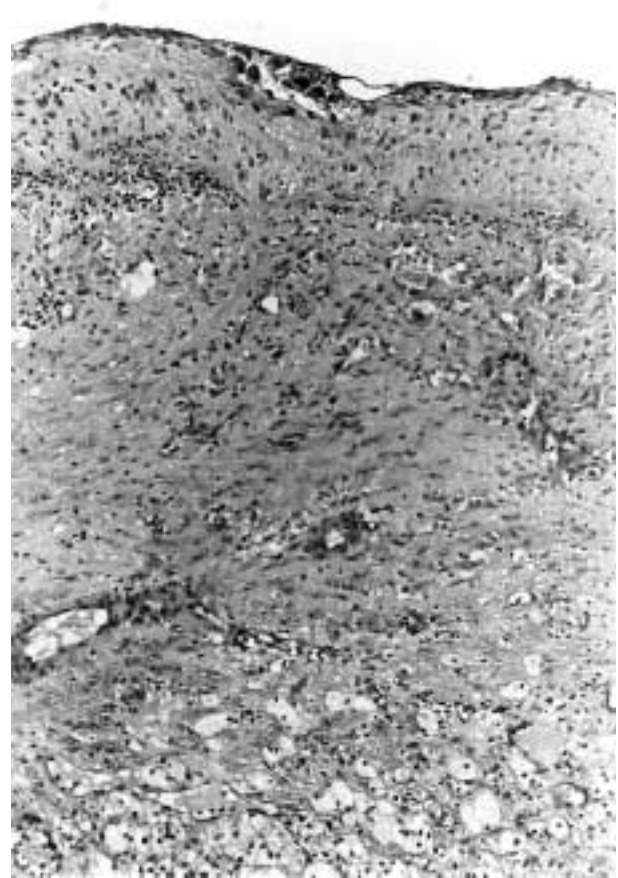
Fig. 3: Normal adrenal cortex and part of the wall of a huge neoplastic cyst. Hematoxilin-eosin x 100.

Microscopically, we found a cellular proliferation that effaced the normal appearance of the adrenal gland. The mass consisted of tubular, pseudoglandular or alveolar structures that were intermixed with solid foci of morphologically