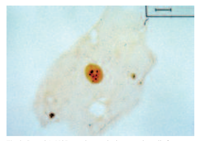
Fig. 2: Several AgNORs can be seen in desquamative cells from smokers. Modified Ploton's technique. 100X.

will substitute the biopsy and this procedure is widely used as a previous test in white lesions suspicious of malignancy. Even exfoliative cytology is a non-invasive and easy to achieve procedure and the silver staining technique allows the assessment of the cellular proliferative capacity. In our review of the literature, we found only three studies reporting on the use of these techniques for assessing the tobacco effect on the oral mucosa of chronic smokers (6-8).